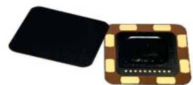
A TrustedBio module, showing the sensor surface (left) and, on the reverse side (right), our ASIC and connection circuits

The capacitive sensor in a TrustedBio module is covered by a robust, protective coating, allowing for years of usage. IDEX's bendable sensor is relatively inexpensive to manufacture and allows for an approximately 90 square millimeter sensor surface area, which is more than twice the size of competitive silicon sensors 6 . The size of the silicon chip (ASIC) within IDEX's sensor is not directly related to the size of the sensor itself, which means that IDEX uses less silicon in the design for a given sensor size. In addition to this, IDEX uses high volume, mass-market, industry standard package technology to maintain cost-effectiveness. The capacitive sensor in a TrustedBio module produces a larger image, yielding more data, which IDEX believes enables superior scanning, feature extraction, and matching performance. Semiconductor-based sensors can have higher electrode density, but their