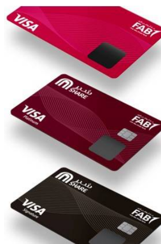
A standard-format smart card, utilizing our fingerprint authentication solution, offered by First Abu Dhabi Bank and manufactured by our customer, IDEMIA France SAS

Our current product portfolio consists of fingerprint authentication modules, related software, and cardholder enrolment solutions. Our latest generation of fingerprint authentication device,